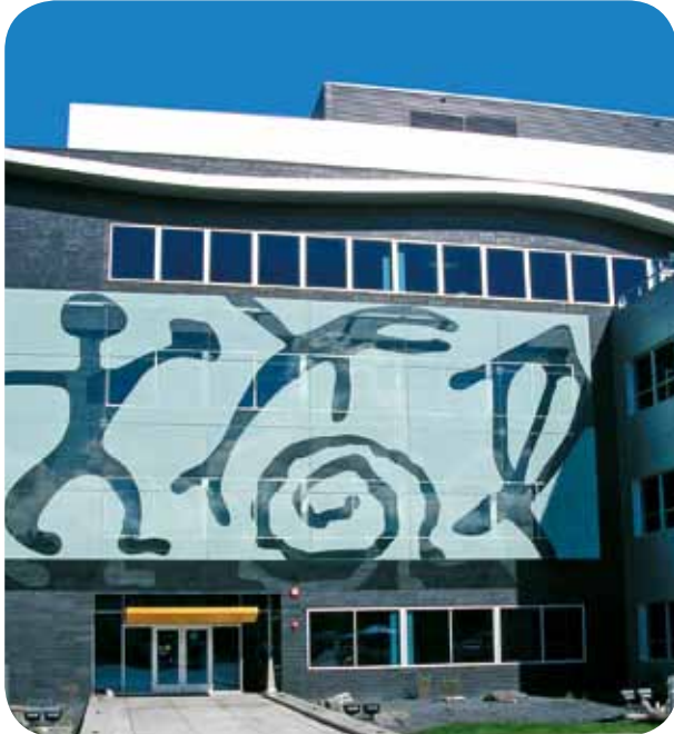
AMC THEATRE, California, USA. (Non-standard screen printed design)